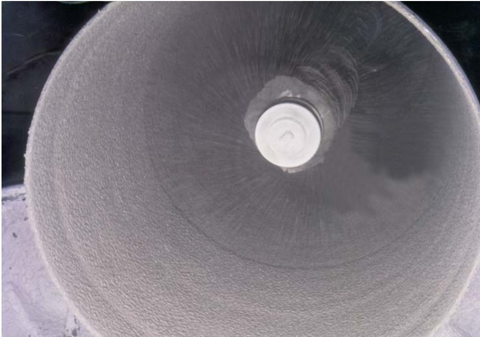
Cement-mortar lining in 24" (600mm) diameter pipe.