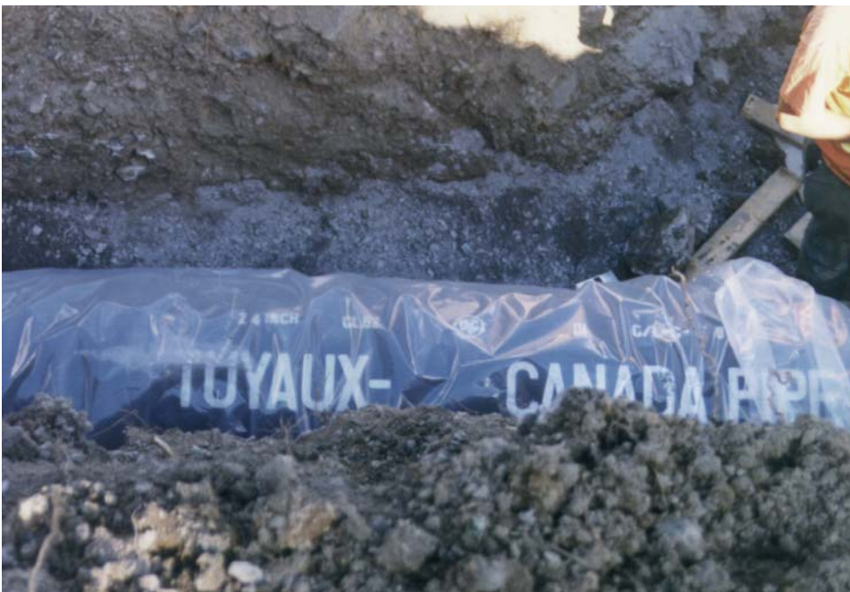
Ductile Iron Pipe installed with 8 mil polyethylene encasement in aggressive soil conditions.